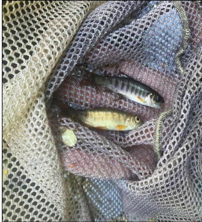
Figure 1.–Juvenile coho salmon caught at waypoint 1043.