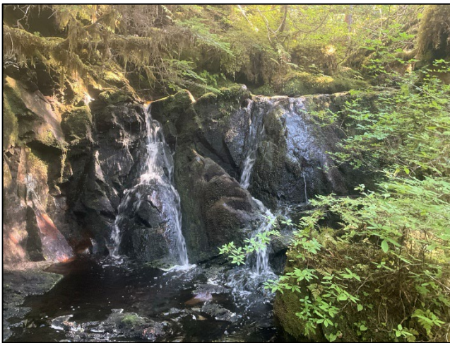
Figure 2.– Bedrock falls barrier at waypoint 1043.