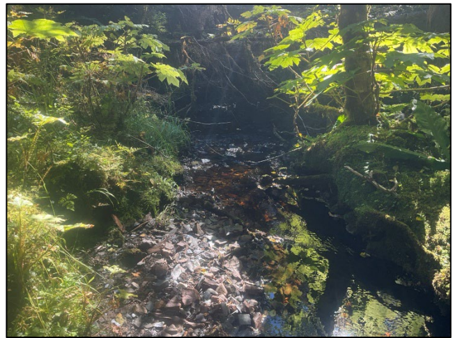
Figure 3.– Channel at waypoint 1044.